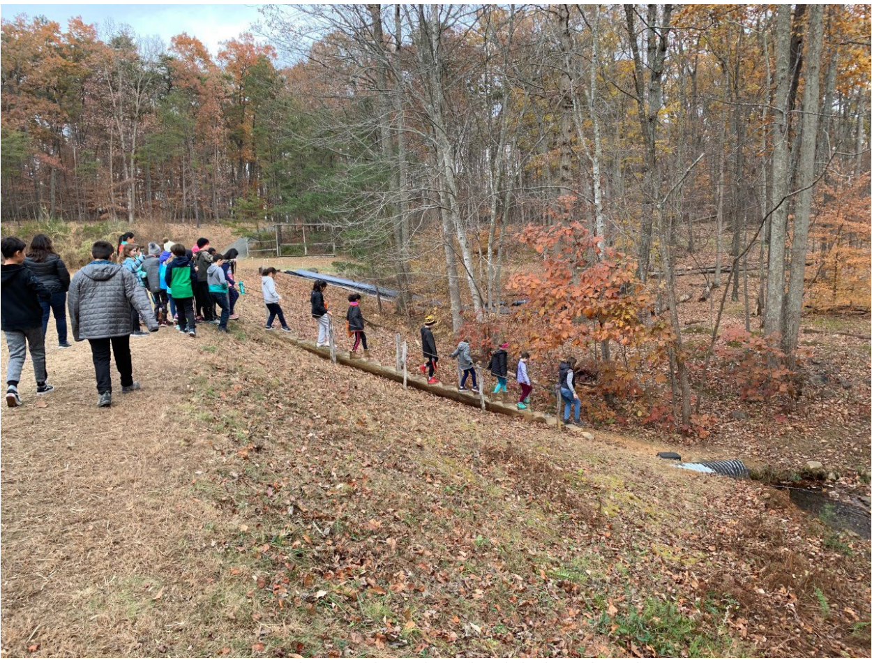
Figure 3 – Students Visit the Outdoor Lab and Check Out the Snake Pit