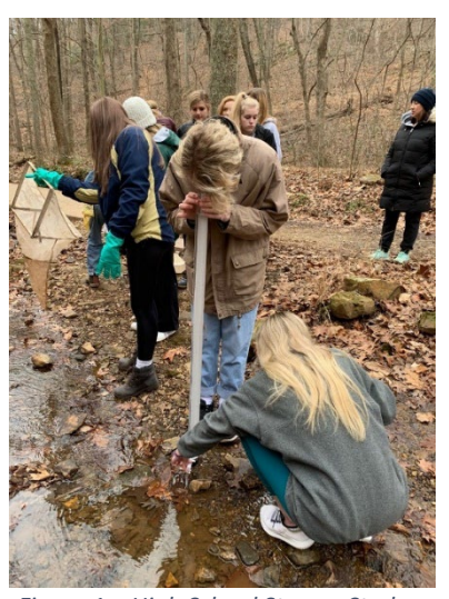
Figure 1 – High School Stream Study

The National Oceanic and Atmospheric Administration (NOAA) Bay Watershed Education and Training (B-Wet) program provides local grants to K-12 districts in the Bay Watershed to focus on project-based learning through Meaningful Watershed Educational Experiences (MWEE). The goal of this program is to provide all high school biology students with a comprehensive understanding of how stormwater runoff affects the local watersheds and to assist students in developing solutions through project-based learning. An additional 16 teachers were trained and participated in the B-Wet cohort during this reporting period, during which they gained a comprehensive understanding of stormwater management, watershed stewardship, and human impacts to the environment.