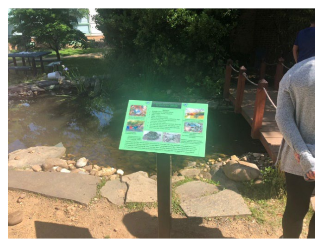
Figure 2 – Campbell Elementary Wetlands Lab Signage

Campbell Elementary School takes advantage of a unique opportunity to expand its hands-on, inquiry-based approach to education by converting a wet and swampy area of their schoolyard into a Wetlands Learning Lab<sup>2</sup>. Overflow from a wetlands spring goes into a dry stream leading to a rain garden and then into a 60x20 foot vegetated bioswale. The bioswale collects ground water from the natural seeps that occur throughout the area. All the students and staff at Campbell are engaged in the wetlands learning lab.