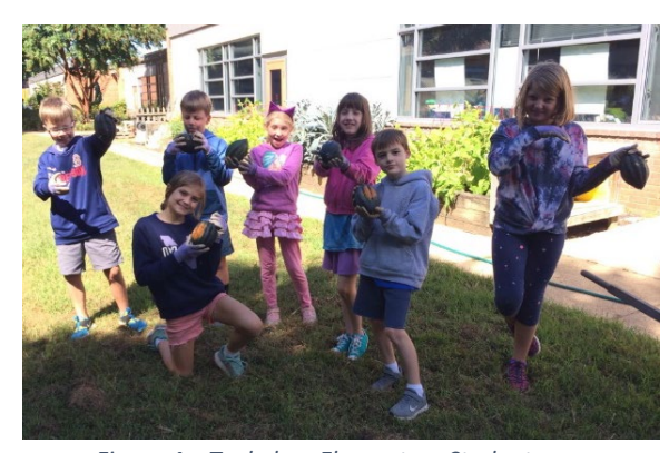
Figure 4 – Tuckahoe Elementary Students

Many APS schools have rain gardens and other stormwater facilities that have been incorporated into a school's instruction. Figure 4 shows Tuckahoe Elementary's students working in their garden.