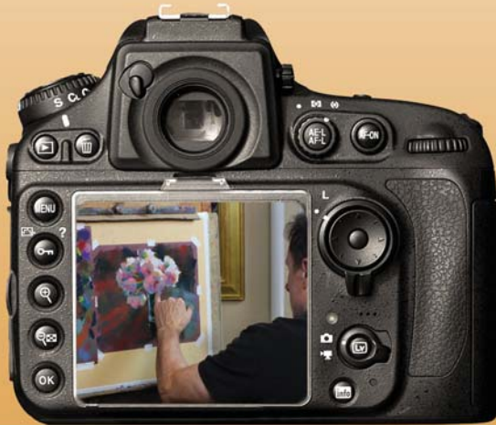
Pastel & Oil Painting p. 9 Digital Photography p. 10