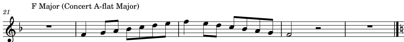
F Major (Concert A-flat Major)

The Chromatic Scale should be performed legato ascending, staccato descending.