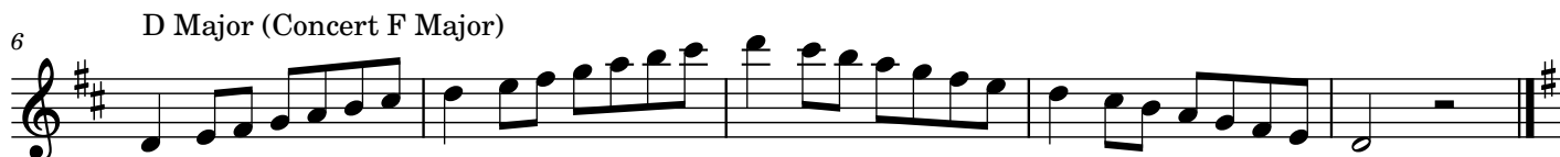
D Major (Concert F Major)