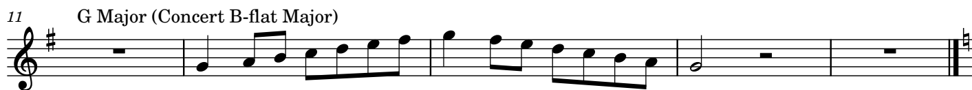
G Major (Concert B-flat Major)