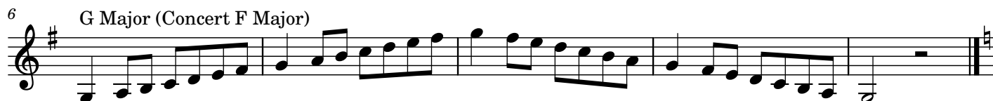
G Major (Concert F Major)