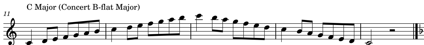
C Major (Concert B-flat Major)