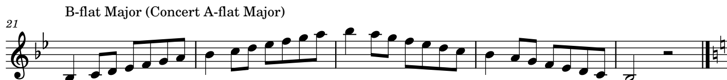
B-flat Major (Concert A-flat Major)

The Chromatic Scale should be performed legato ascending, staccato descending. Students may perform additional octaves if desired, or use the District 12 audition requirement.