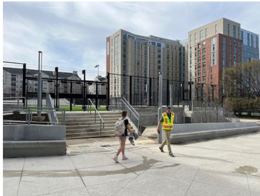
Looking west from park toward new field