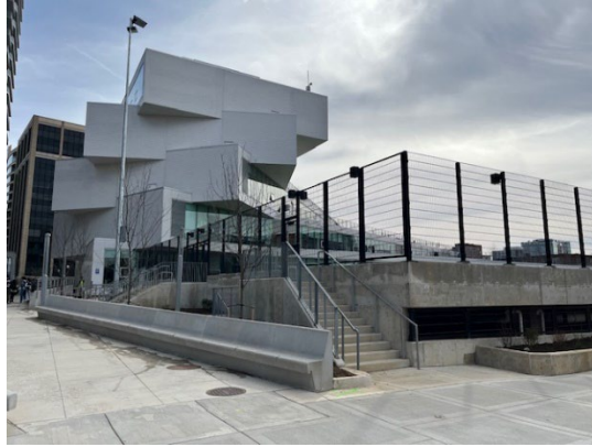
Looking south from 18 th Street