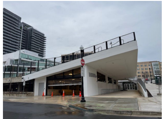
Looking south toward Shriver entrance