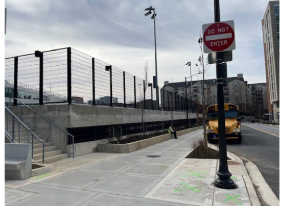
Looking west on 18 th Street