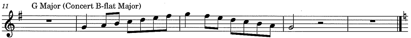
G Major (Concert B-flat Major)