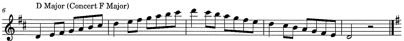
D Major (Concert F Major)