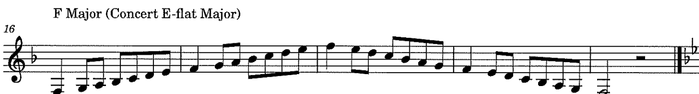
F Major (Concert E-flat Major)