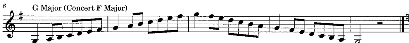
G Major (Concert F Major)