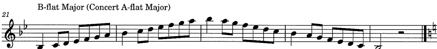
B-flat Major (Concert A-flat Major)

The Chromatic Scale should be performed legato ascending, staccato descending.