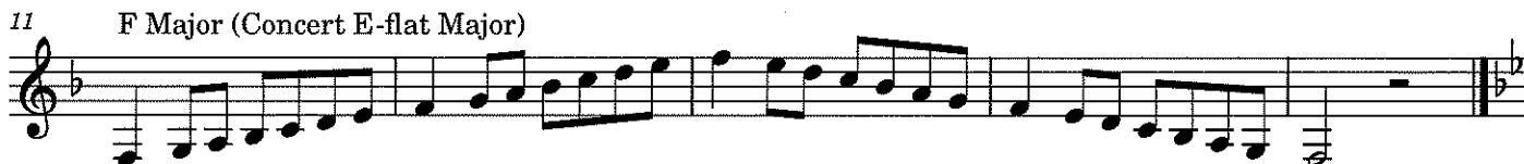
F Major (Concert E-flat Major)