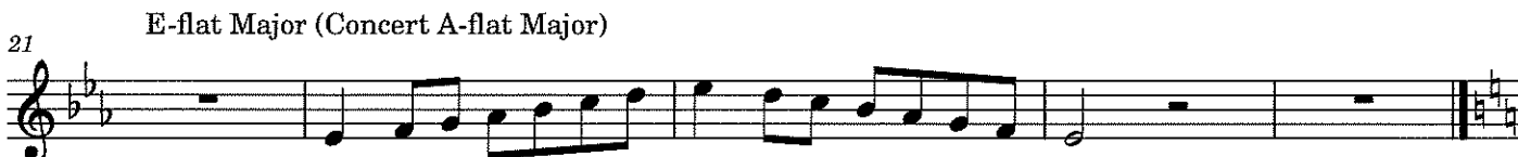
E-flat Major (Concert A-flat Major)

The Chromatic Scale should be performed legato ascending, staccato descending.