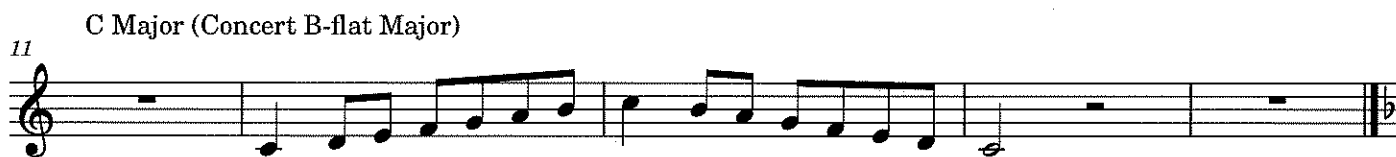
C Major (Concert B-flat Major)