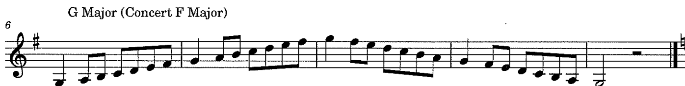
G Major (Concert F Major)