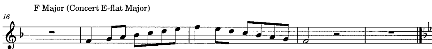
F Major (Concert E-flat Major)